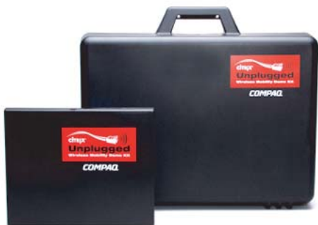
◀ 635 snapcase - 629 weekendercase, 001-black

Call us today and find out how we can help your company distinguish itself from the competition.